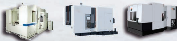
Horizontal Machining Centers, 50 Pallets

Oy Nimetech Ab has a well-established position as a subcontractor and as a system supplier.